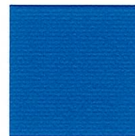
216MST Blue #808266