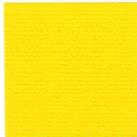
202MST Yellow #808252