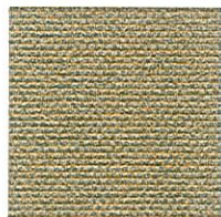
233MST Bronze #808283