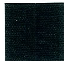
214MST Black #808264