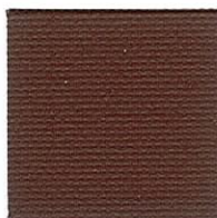
210MST Cranberry #808260