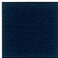
224MST Indigo #808274