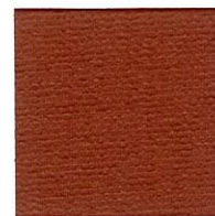
225MST Terra Cotta #808275