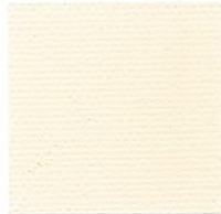
229MST Ivory #808279