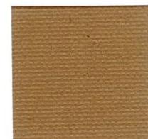
211MST Toast #808261