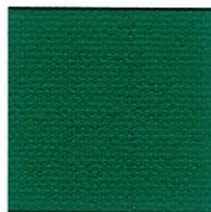
204MST Dark Green #808254