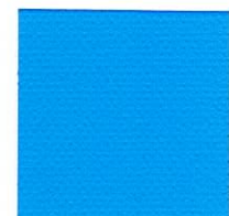
205MST Turquoise #808255