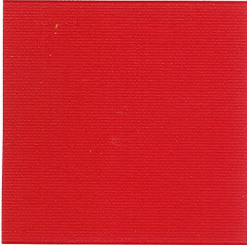
200MST Red #808250