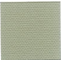
227MST Dark Linen #808277