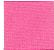
209MST Pink #808259