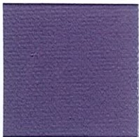
207MST Dark Lavender #808257