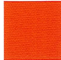
201MST Orange #808251