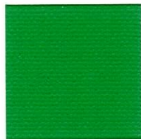
203MST Grass Green #808253