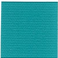
228MST Teal #808278