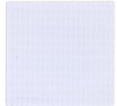
0606 WHITE 853004 (853104 CBII)

Lighter colors are more translucent than darker colors. Please hold the card up to the light to see how each color illuminates. Colors are representative only. Small variations in shade should be anticipated and are within commercial tolerances.