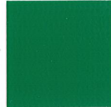
0355A LT GREEN 853019 (853119 CBII)