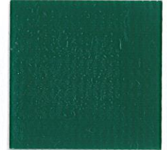
2108A GREEN 853008 (853108 CBII)