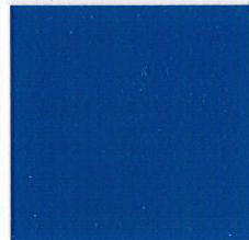
0301 MID BLUE 853015 (853115 CBII)