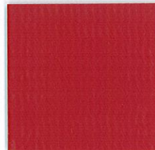
2283A DARK RED 853012 (853112 CBII)