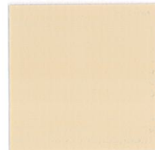
2146A IVORY 853011 (853111 CBII)