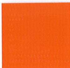
2119A ORANGE 853010 (853110 CBII)