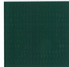
4048 FOREST GREEN 853018 (853118 CBII)