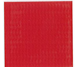
2662A LIGHT RED 853014 (853114 CBII)