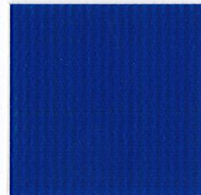
5025 REFLEX BLUE 853024 (853124 CBII)