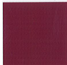
2020 BURGUNDY 853005 (853105 CBII)