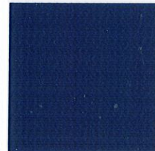
2114 DARK BLUE 853009 (853109 CBII)