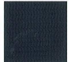
2025 BLACK 853006 (853106 CBII)