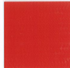
0132 BRIGHT RED 853023 (853123 CBII)