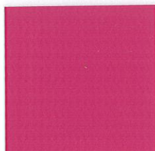
0219A PINK 853017 (853117 CBII)