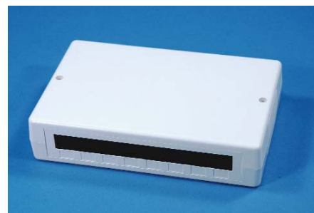
Optional M-PAD Plus Router