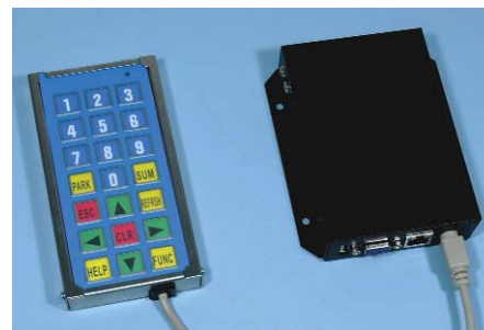
M-PAD Plus Controller & Keypad

The M-PAD Plus controller is a snap to install with no jumpers or internal settings. Using only the configuration menu, select your preferred vendor built-in KDS software application. Then plug in a VGA monitor, power cord, RS-232C or Ethernet link, and your keypad. Connect multiple M-Pad Plus units as required for your system using the optional router.