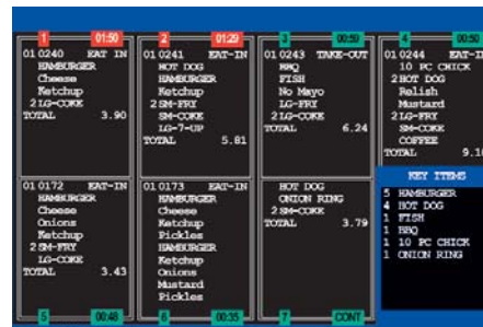
Key Item Summary