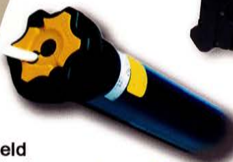
Somfy® tubular awning motor