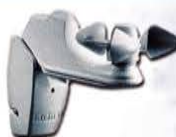
Decorator Somfy-Matic Automatic Sun & Wind Control