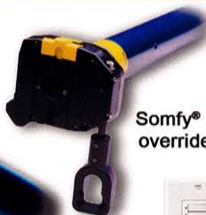
Somfy® manual override motor