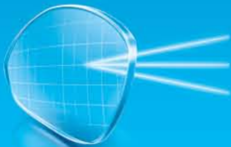
Front Varilux Physio design

1. The prescription and Varilux Physio design on the front of the lens are analyzed to create the back side design.