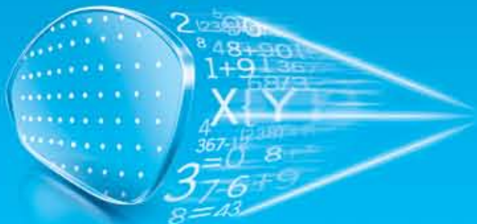
Back Point-by-Point Prescription Mapping

2. A patented manufacturing process applies the backside design, point-by-point, with absolute precision.