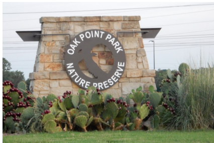
Oak Point Park Nature & Retreat Center