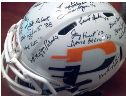
Pawhuska football helmet signed by some of the awardees of the Ormand Beach Award.

I have to share the story of the helmet you see to the left. My parents are from Pawhuska, Oklahoma. My paternal grandma had three brothers, and one of them was a famous University of Kansas football player (with his defensive ability they held Notre Dame to an unheard of tie). He became a Canadian Rugby player in the 1930s. He died in an industrial accident in 1937. They named the high school football stadium in Pawhuska after him - The Ormand Beach Memorial Stadium. My dad and I, along with my uncle from Oklahoma (who also has a pest control business), attended a Historical meeting in Pawhuska this spring. They invited football players who had received the Ormand Beach Award over the last 67 years. About 25 awardees attended and signed this helmet. A family bought the helmet in an auction at the event and then surprised us family members by generously giving it to us. It will be a treasured family piece from now on.