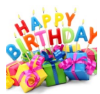
BIRTHDAYS & ANNIV.