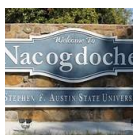
FOCUS ON COMMUNITY