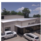
BUILDING OUR BUSINESS