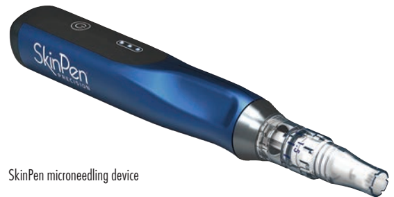
SkinPen microneedling device