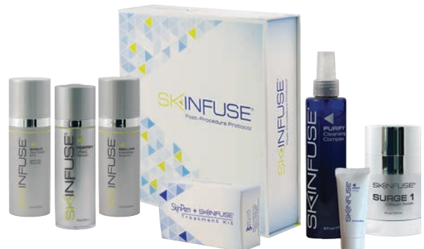
Skinfuse post-microneedling protocol