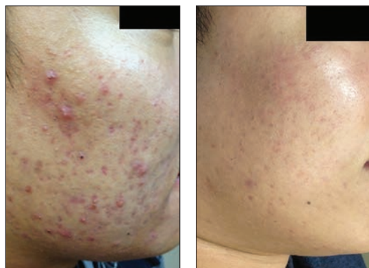
26-year-old male before and after three SkinPen procedures