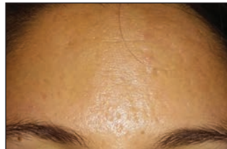
Before and after six SkinPen procedures

Calming Complex, a post-procedure gel that soothes the skin; Skinfuse Reclaim Hydrating Support, a nutrient-rich moisturizer formulation; Skinfuse Forfity Vita C Serum antioxidant; and the Skinfuse Shield Zinc Oxide 21% sunscreen.