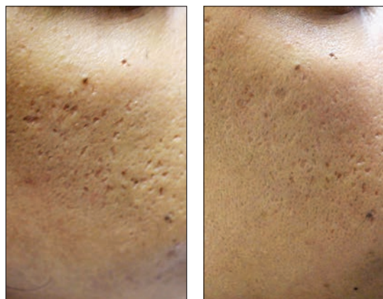
38-year-old female before and after five SkinPen procedures