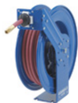
8.723-649.0 (hose and ball stop not included)

Coxreels offer high performance in a very compact and lightweight hand crank or spring-driven hose reel. Perfect for mobile application and permanent floor and wall mount.