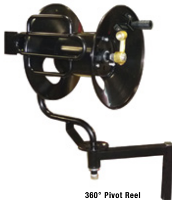
360° Pivot Reel