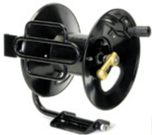
Fixed Base Hose Reel

Offering 100' and 200' reels in both a fixed base and 360 degree rotating base. The oversized reel holds the advertised length plus leaves additional space reducing the difficulty of reeling hose. The unique extended swivel improves the hose connection and reduces hose wear and stress.