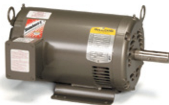
3 Phase 184T Frame