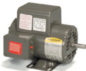
1 Phase 56 Frame