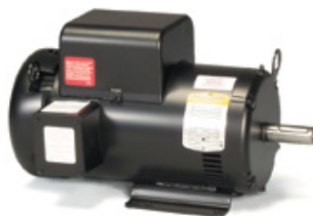
1 Phase 184T Frame